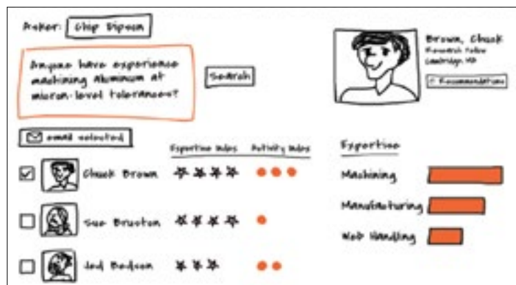
An example visualization of data sources used for peer research on common interest topics.

The managers need to respond with recommendations taking into account not only expertise but also whether they believe a collaboration between the two